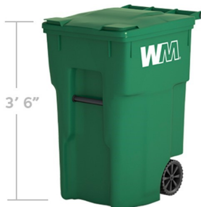
64 Gallon Container