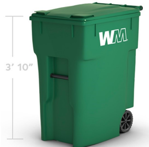
96 Gallon Container